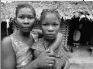
Women and girls in Congo have been subjected to unprecedented sexual violence. Girls like these in rural Congo are forced into survival sex to feed themselves and their families.

Arundhati Roy, commenting on Hotel Rwanda: Hollywood and the Holocaust in Central Africa