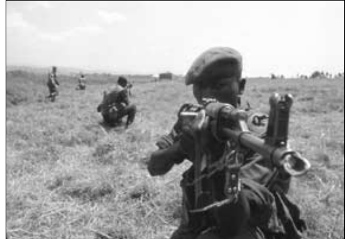
In September 2005 I worked with Congolese soldiers being trained by the U.N. Observers' Mission for Congo (MONUC); soldiers in Congo are also the victims of a ruthless and corrupt international system which is stealing Congo's wealth and starving Congo's people.

In July 2005, partnered with a Belgian filmmaker, I later led a mission deep into central Congo. Hiking with a caravan of porters some 300 kilometers into the forest, we built a raft, and floated for three weeks (600 kilometers) down the Lopori river, surveying western