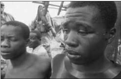
Frightened by the prospect of being shot as Rwandese rebels, these young boys were taken prisoner by Congolese troops on a mission I accompanied. In the end they were released, partly due to my discussions with the commanding officer: they were obviously too young to be involved in the war in Rwanda.