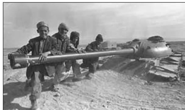
Tanks litter Afghanistan, the legacy of decades of war and occupations. Children playing on abandoned weaponry and unexploded ordnance (UXOs) are frequently maimed or killed; landmines are everywhere.