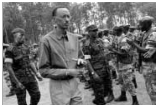
With elections approaching in DRC, the Congolese people are wondering when the rest of the world will see through the facade of President Joseph Kabila's incumbency. Who's behind who? Joseph "Kabila" (believed to be Joseph Kanambe, far left) was, in 1995, the bodyguard of now Rwandan military leader Paul Kagame (center).

Last summer I accompanied MONUC forces on field missions in eastern and western DRC. These missions enabled me to get a clear picture of war in remote areas; I also worked to understand the political, environmental and economic realities in Congolese cities. Some of