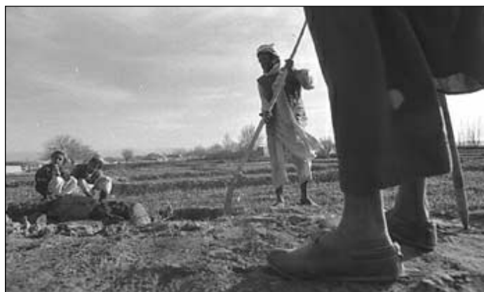
With my Farsi translators, I researched the heroin trade by interviewing poppy farmers working their fields in Sheberghan, northern Afghanistan; most of the north is ruled by “commanders” loyal to the profits of the international heroin trade. Under global inequality, many local farmers are just trying to keep their families alive.