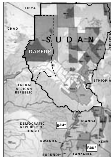
This petroleum industry map reveals the oil at stake in Sudan: concessions are also seen in Congo and Uganda. *Bau= Barrick Gold Corp. mines, a George H.W. Bush interest, operating in five African countries.

This is not about “genocide”—but about global domination, the “war on terror,” and yet another covert (soon to be overt) resource war. Religious leaders met with George Bush about Darfur prior to the recent “protests” in Washington, DC against U.S. failure to intervene. While forcing a small number of multinational corporations to divest from holdings in Sudan, the Darfur “genocide” lobby is merely paving the road—quite literally—to get at Sudan’s resources; other factions are already benefitting.