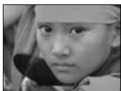
A young Tibetan pilgrim at the Kalachakra 2006.

The goal is to petition to H.H. the Dalai Lama, Tibetan Government, Tibetan Human Rights Society, and all Monasteries in and out of Tibet to stop this violence. (The problem of sexual abuse in monasteries will be undertaken next). Volunteers Against Violence in Tibetan Monasteries ask all people to support this campaign by supporting the monks who are undertaking it. Donations are needed to cover expenses for mailings, posters, flyers and travel for monks within India. ☺