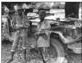
Child soldiers belonging to the Sudan People's Liberation Army—the southern faction that has been armed, trained and supported by the U.S. and its Ugandan allies.

Virtually all information about the situation in Darfur stems from elite think-tanks, organizations or policy sources in the U.S. and Europe (e.g. see the Center for Security Policy : www.divestterror.org ). Some U.S. business factions are cooperating with, and some seek to overthrow, the Islamic government of Sudan. However, Anglo-American military imperatives universally serve corporate interests. There is also the clash of fundamentalisms: