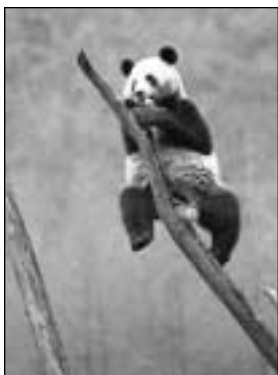
Giant panda in Wolong, China, photographed in March 2006 for Wingspan's "Tao of Panda"