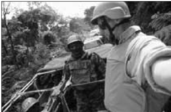
Traveling with MONUC forces during "Operation Iron Fist" (South Kivu, Congo, July 2005). I was able to observe conditions of life in remote areas unvisited by outsiders for decades.

People's trust and faith is not all that has kept me going. There is also the mystery of life and the instantaneous power of choice—something we all share. It's the hope in the eyes of the people I meet, survivors of unspeakable injustice, disillusioned students, and the faith I have seen in people—Africans or Afghanis or Chinese or New Yorkers—that we Americans will pull ourselves together, stand up for what we believe in, and do the right thing.