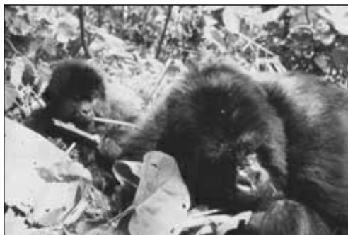
Face to face with a gorilla at Mt. Karisimbi, Zaire (1991) where my Congolese odyssey began.